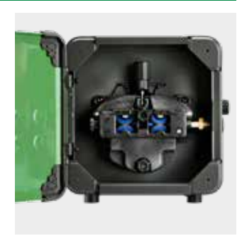
Cold Wire Feeder: four-roll wire feed system, synchronised pulse on wire and memory for individual settings