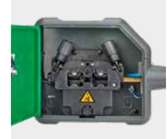
RWF 30 - robot wire feeder for SIGMA SELECT (MIG) with four-roll wire feed system and built-in functions.