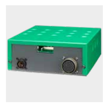
RCP I/O interface prepared for anybus communication.